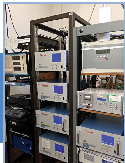
Instrument Rack in Typical Air Monitoring Station