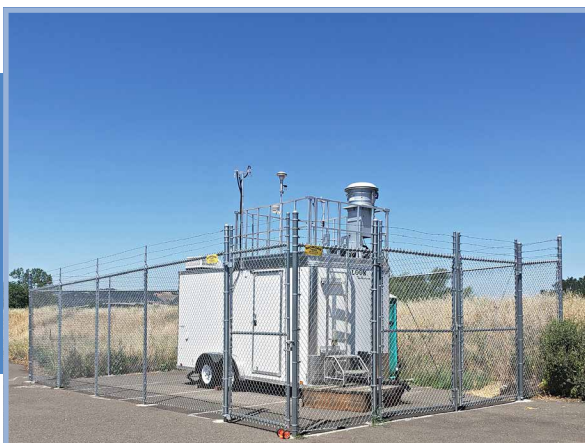
Active District Air Monitoring Station

The Air District's air monitoring stations use complex instruments that continuously monitor ambient air for specific pollutants. Because the instruments are very sensitive, the inside of the station must be kept within a specific temperature range, and the equipment is maintained in a self-contained shelter or indoor space with direct roof access. Certain types of monitors are placed directly on the roof of the shelter while a sampling line brings air from above the station into the instruments located indoors. Many air monitoring stations also include a meteorological tower with sensors that measure wind speed, wind direction and other meteorological parameters. While many of our monitoring stations are installed in mobile trailers, they are typically intended to collect long term data and remain at a fixed location once a site is chosen.