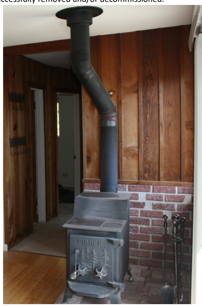
Photo of the existing device, and room where the device is located, showing floor, ceiling, and any other distinguishing features of the area such as a window or door. This photo will be compared with the "after photo" to confirm that the device was successfully removed and/or decommissioned.