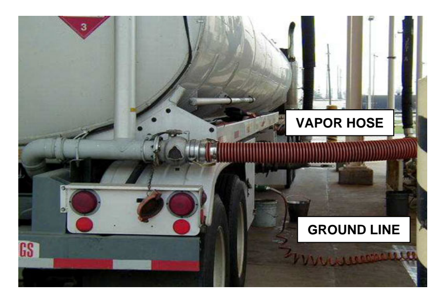
Figure 2 Tank Truck Connects to Vapor Hose

gasoline and gasoline additive into the bottom of the cargo tank below the liquid level, once a level of gasoline is in the cargo tank. This loading is called "bottom fill" or "submerged loading", the purpose of which is to minimize the formation of gasoline vapors during the loading operation. Gasoline loaded into the cargo tanks displaces the gasoline vapors that were present in the cargo tanks prior to loading. The vapors exit the cargo tanks through the vapor recovery hose to the gasoline bulk terminal's vapor recovery system.