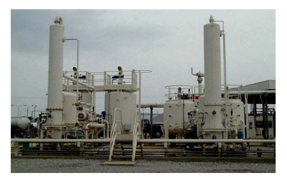
Figure 3 Example of Terminal Vapor Processing Unit

Thermal incineration vapor recovery systems. Some gasoline bulk terminals choose to burn their hydrocarbon vapors rather than capture and recycle them. This approach is called thermal incineration.