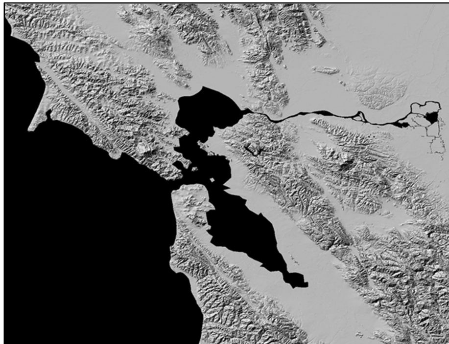
Figure 1: Map of San Francisco Bay Area Region

The report is prepared pursuant to Section 40728.5 of the California Health and Safety Code, which requires an assessment of socioeconomic impacts of proposed air quality rules. The findings in this report can assist Air District staff in understanding the socioeconomic impacts of the proposed requirements, and can assist staff in preparing a refined version of the rule. Figure 1 is a map of the nine-county region that comprises the San Francisco Bay Area Air Basin.