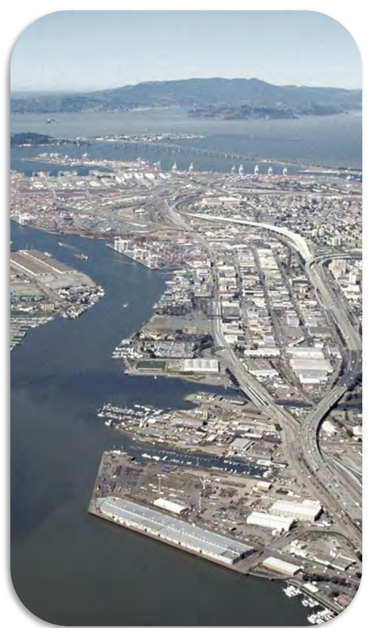
Community Equity, Health and Justice Committee November 15, 2023