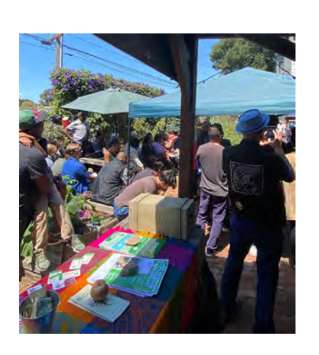
Community organizing Organizers and residents come together.

60k+ views 1,300 likes 1,400+ shares 160+ comments