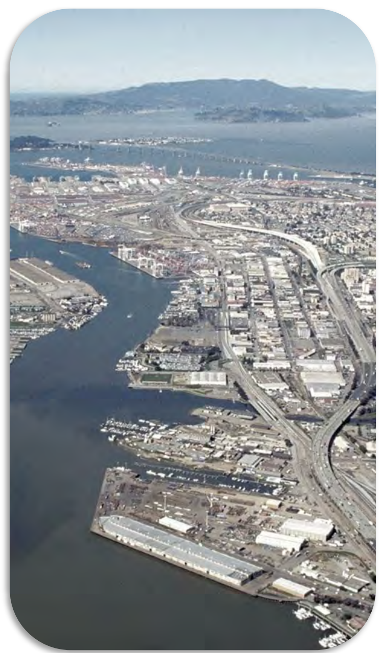
Community Equity, Health and Justice Committee November 15, 2023