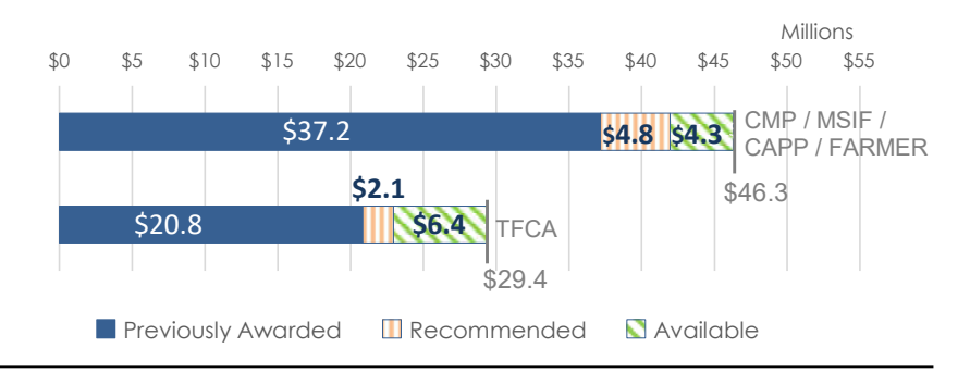
Figure 2. Funding awarded and allocated in FYE 2022 by county

includes funds awarded, recommended for award, and available