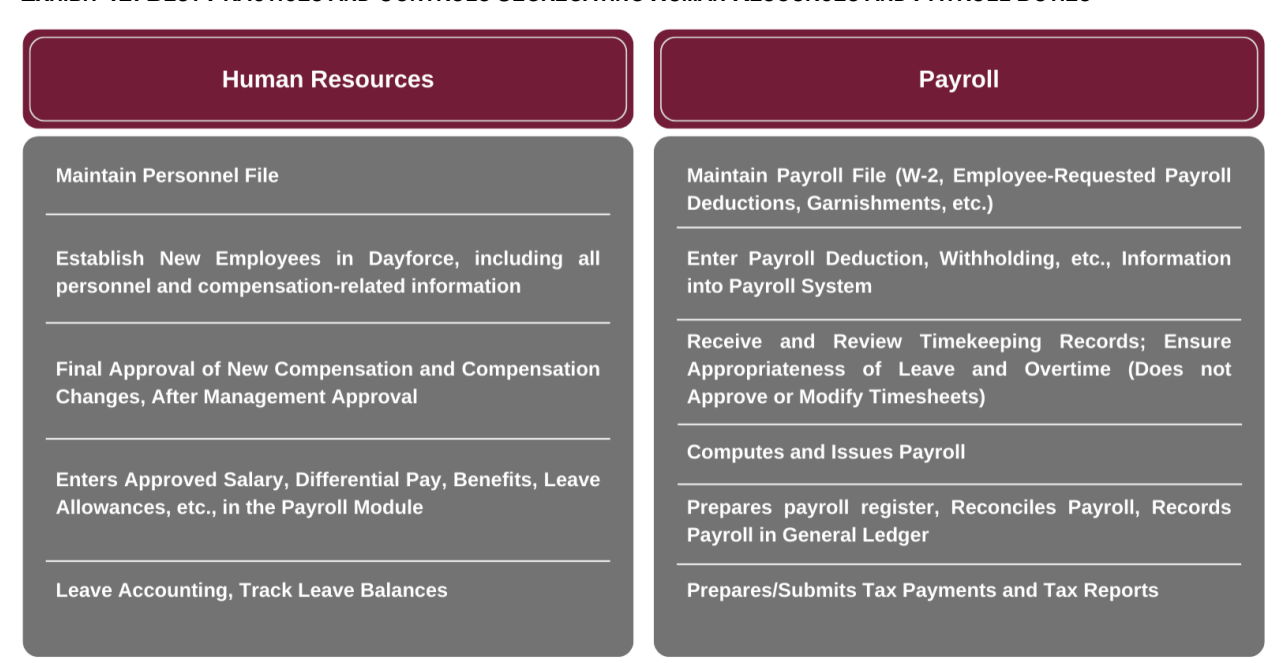
EXHIBIT 12: BEST PRACTICES AND CONTROLS SEGREGATING HUMAN RESOURCES AND PAYROLL DUTIES