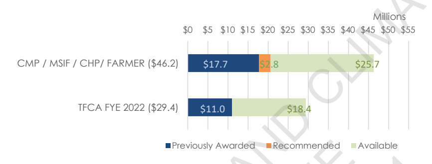
Figure 2. Funding awarded and allocated in FYE 2022 by county

includes funds awarded, recommended for award, and available