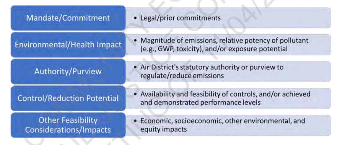
Figure 1. Proposed Prioritization Factors

Previously, Air District staff relied on the Clean Air Plan to provide priorities for source evaluations and rulemaking. However, there is now a need for a more frequent and nimbler process that can incorporate community priorities, such as the measures included in Assembly Bill (AB) 617 Community Emission Reduction Plans (CERPs). To address this need, staff is developing the Source Prioritization Framework to prioritize the long list of sources and rules currently identified as needing further research and/or development. This framework was born out of the multi-divisional work being done for the AB 617 Richmond-North Richmond-San Pablo CERP, and began with a list of prioritization factors, shown below, that will guide the selection of priorities. For deciding which factors are "key", or weighted more heavily throughout the process, staff is proposing to lead with health, and to also place importance on meeting legal mandates and previous commitments.