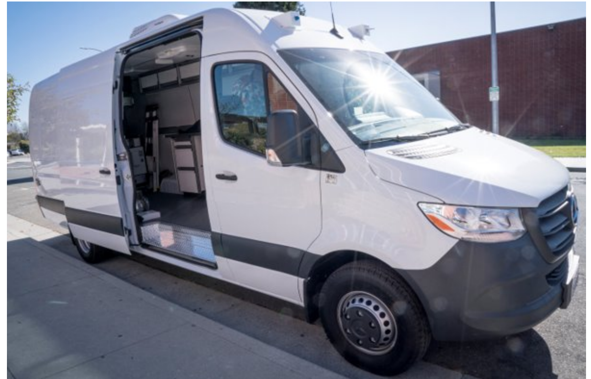
Air District's mobile air monitoring van