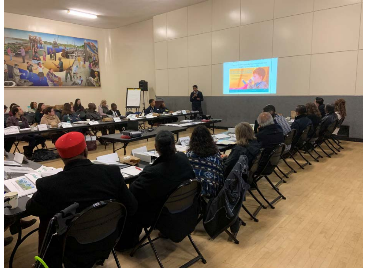
In-person meeting of the Community Steering Committee