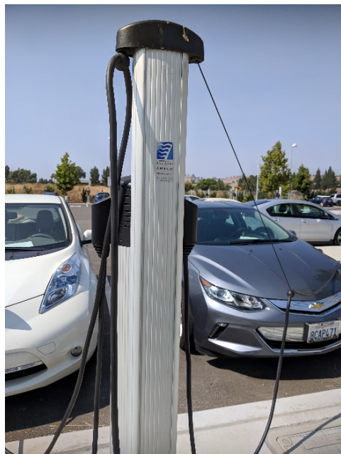
Warm Springs BART Station, Fremont)