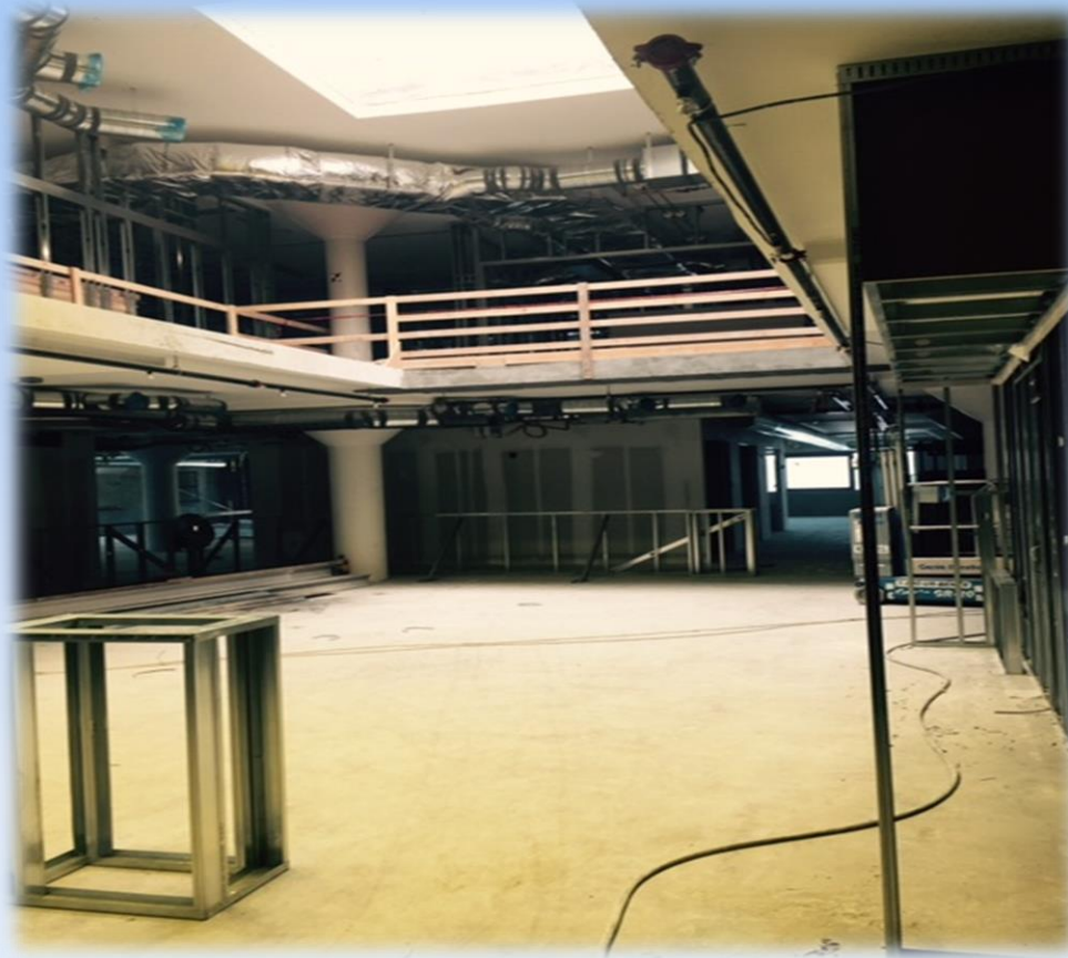
Figure 3: Installation of Mechanical Ducts around skylight on Level 8 & Framing of Technical Library on Level 7