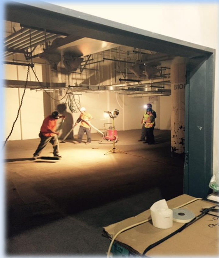
Figure 4: Data Center Floor on Level 2