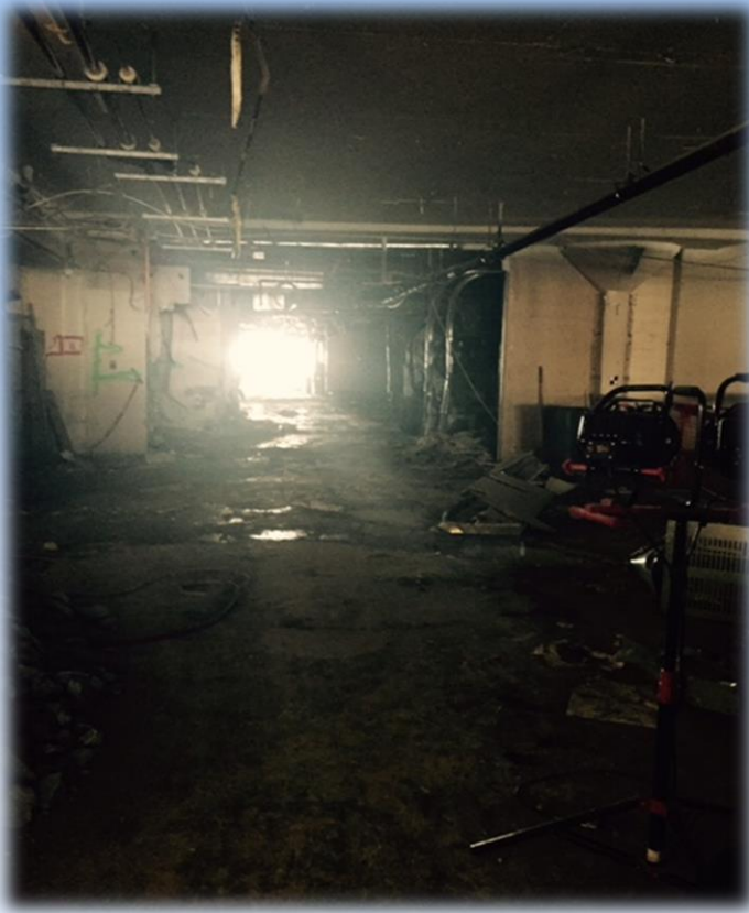
Figure 1: Demolition of DEA Space - Level 8