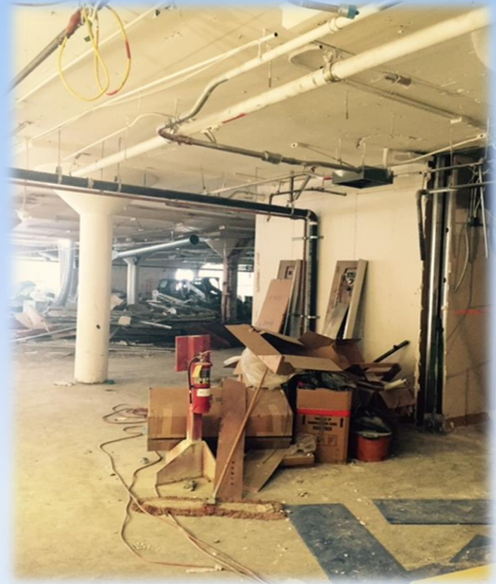
Figure 2: Demolition of DEA Space - Level 8