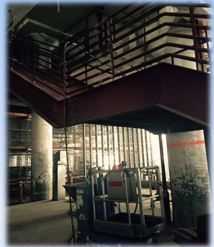
Figure 5: New Stair 3 riser on Level 1