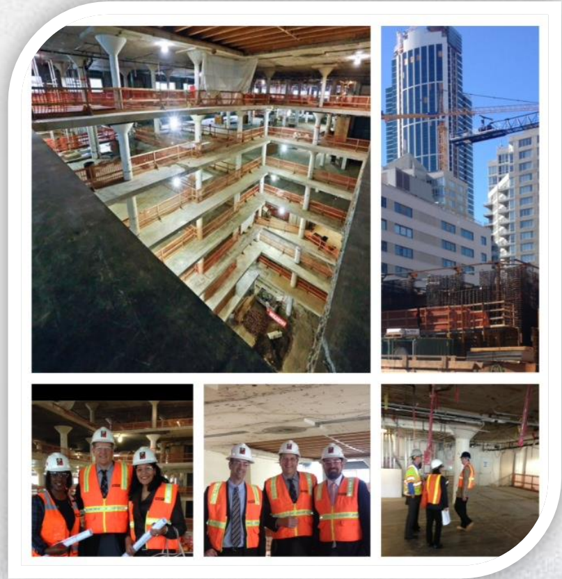
1) Atrium view from 8 th floor; 2) 201 Folsom Street project, four tower cranes in place. 3) Air District and BAHA staff touring building.