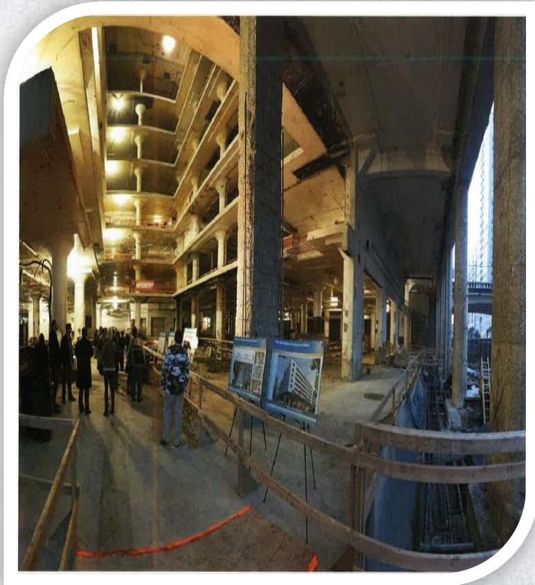
Open house held by McCarthy and BAHA for the neighbors to see the completed atrium, after several months of evening demolition. (View from future entry at 375 Beale)