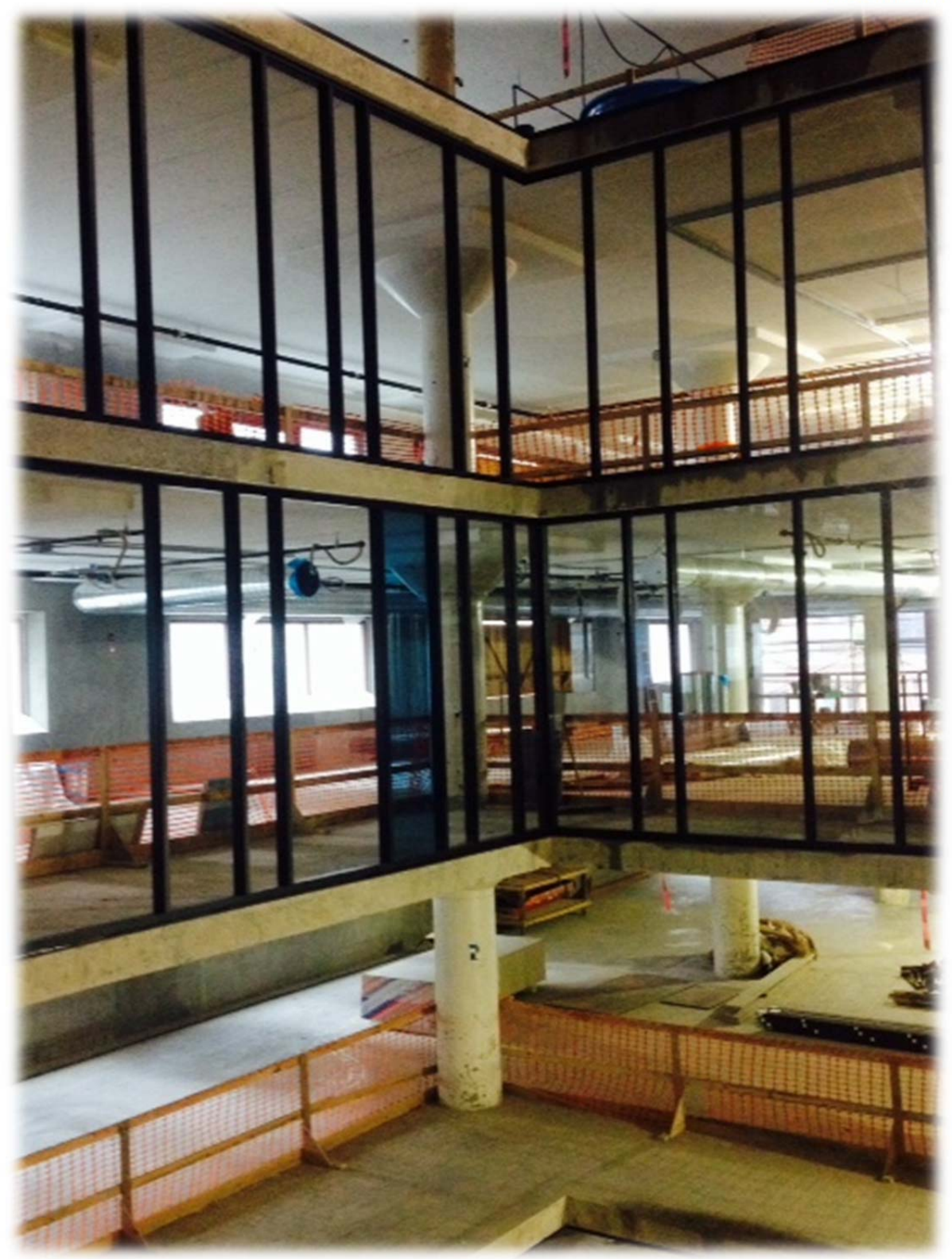
Figure 4: Mock atrium glass enclosure on Level 6 & 7.