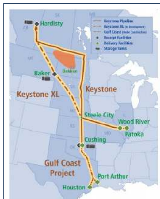
Figure 1 Proposed Route of the Keystone XL Pipeline

On May 4, 2012, TransCanada submitted a new application for a Presidential Permit covering the revised route from Alberta to Nebraska. Consideration of the new application is currently underway at the Department of State. A Draft Supplemental Environmental Impact Statement (SEIS) was issued by the Department of State on March 1, 2013; comments on the draft SEIS have closed. More than one million letters were submitted with comments on the draft SEIS. The Department of State has not issued a timeline for making a decision on the Presidential Permit, but is anticipated to act within the next two-three months.