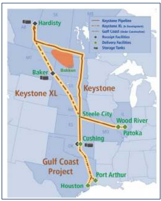
Figure 1 Proposed Route of the Keystone XL Pipeline

Since 2008, TransCanada, a pipeline operator, has been seeking permission to construct a 36" diameter pipeline from Alberta, Canada to oil refineries in the The proposed Keystone XL Pipeline, shown as a dashed line in Figure 1, would be able to move 830,000 barrels a day of oil extracted from oil sands. (TransCanada operates an existing 30" pipeline. which is shown as a solid line in Figure 1.) Because the proposed pipeline would cross the Canada-United States border, a Presidential Permit is required; this Permit is issued by the United States Department of State if it is determined that the proposed pipeline is in the "national interest." In December 2011, the Department of State denied the application for a Presidential Permit. In response, TransCanada made a number of modifications to the proposed route to avoid concerns raised by the State of Nebraska and split the overall project into two distinct phases: one from Alberta to Steele City, Nebraska, and another from Cushing, Oklahoma to the Gulf Coast. (TransCanada proposes using existing pipelines to