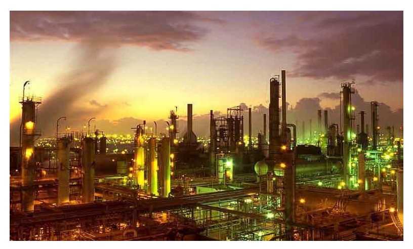
NSR and Title V are comprehensive permitting programs that apply to all stationary sources in the Bay Area that emit more than specified threshold amounts of regulated air pollutants.

"New Source Review", or NSR, is a pre-construction permitting review requirement that ensures that when a new source of air pollution is built, or when an existing source is modified, the source will implement effective emission control technology and will comply with related regulatory requirements pertaining to air emissions. NSR is primarily aimed at ensuring that the region's air will comply with air quality standards that have been established to ensure that concentrations of pollutants in the ambient air we breathe remain at safe and healthful levels – the National Ambient Air Quality Standards, or "NAAQS". In addition, the program also addresses other pollutants for which NAAQS have not yet been adopted. NSR permitting focuses on projects at the design stage, before construction on the source begins, where it easiest and most appropriate to incorporate effective pollution control technology (as opposed to having to retrofit a source after it is built). Based upon this pre-construction review, the District issues an "Authority to Construct" for the source, which authorizes construction and imposes permit conditions to ensure that the source satisfies all applicable regulatory requirements. The Air