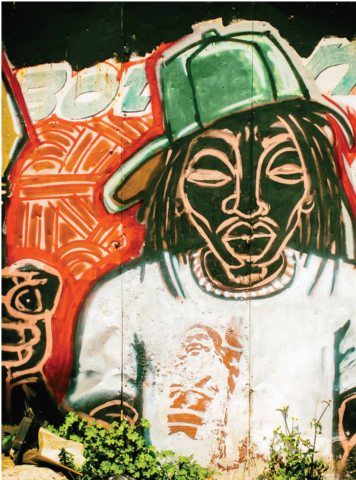
West Oakland graffiti art