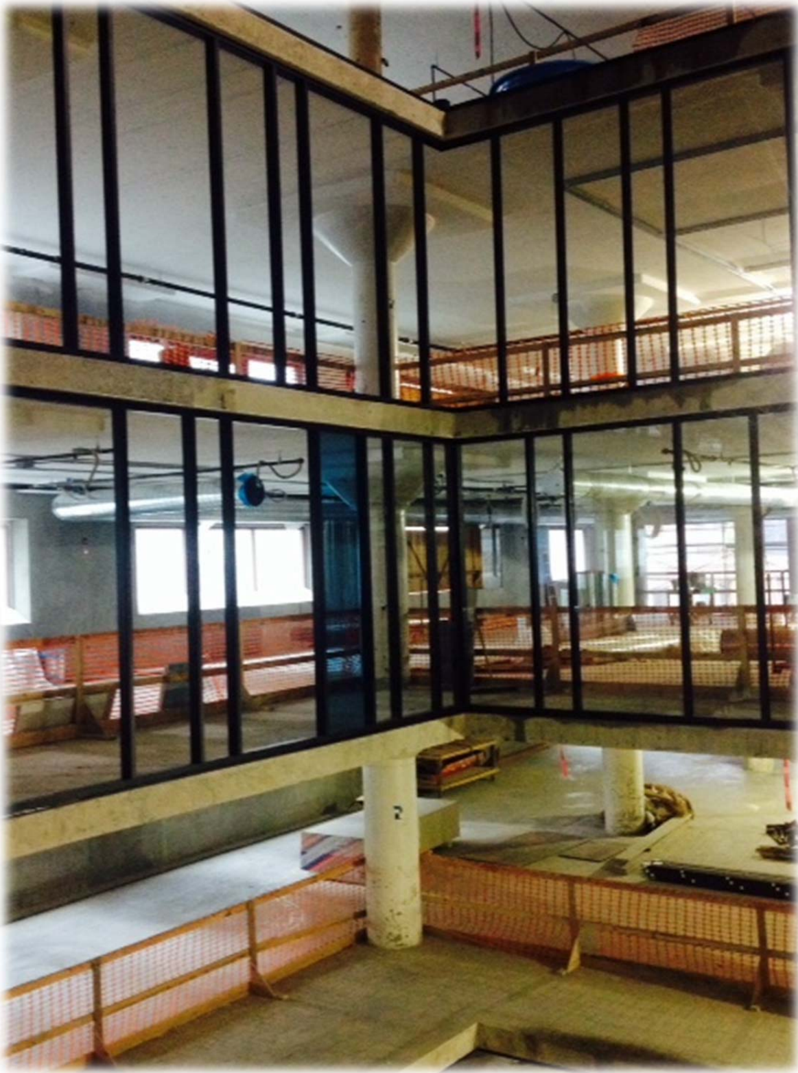
Figure 4: Mock atrium glass enclosure on Level 6 & 7.