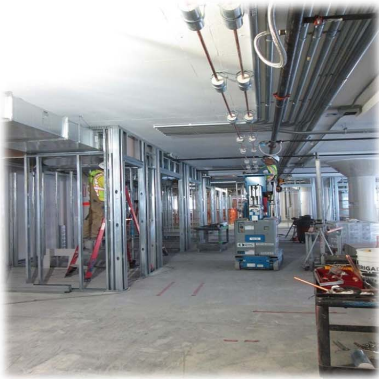
Figure 1: On Level 6, installation of framing, utilities and plumbing overhead.